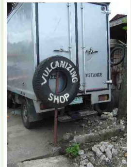
5 points if you can tell me what this sign means.