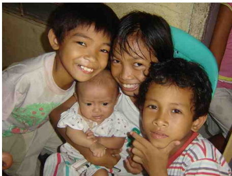
A new addition to the extended Tabitha family.