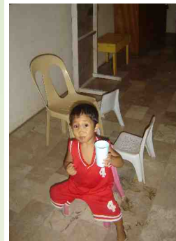
Can you recognize this handsome young man?