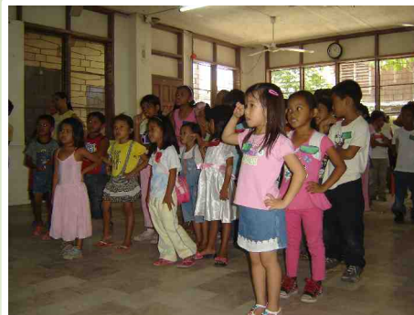
VBS. April 20-24 th , 2010