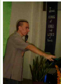
Sharing on forgiveness.