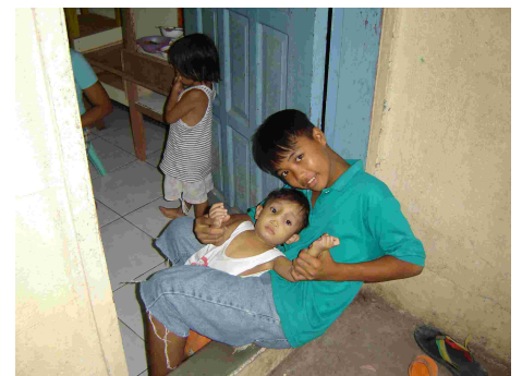
We can't wait to go back!