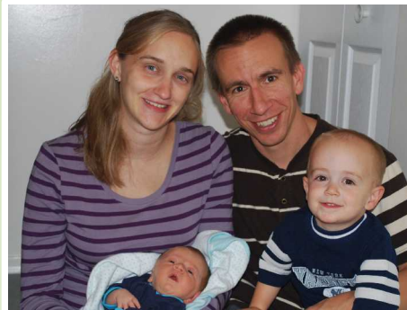
New family shot.