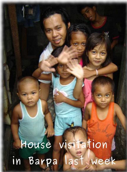
House visitation in Barpa last week

There is a couple visiting from the US and they have decided to give a months supply of milk and vitamins for the kids in Rosemary. Right now we only have the budget for the food one day a week, so this one month supply will be very helpful. The local health workers were very excited about it. Right now we are just cooking the food here at HFTN and then delivering the food using my car. So far it works since it is only one day a week, but eventually we will probably need our own place in Rosemary or at least a small space there to cook the food and have a base of operations. For now though, we are happy to be doing things the way we are doing them because we don't want to expand too quickly. There are a lot of children in the area that need help and we want to build something that is sustainable.