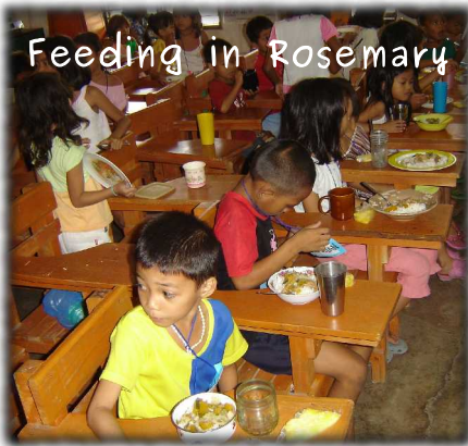
Feeding in Rosemary

March 2009: Things have been busy here in Agdao and Tabitha: Food for Life! We are just about to complete one month of our Saturday feedings in Rosemary, one of the sites we have chosen to expand Food for Life to. The community is still in Agdao, near one of the local open markets. If you like you can click here to go a Google map of the area. Rosemary is right in the center of that. And for your reference House of Jubilee is right here , right underneath the clouds. We decided to work closely with the local government in the area called the barangay (which directly translated means village). These are the grassroots or ground level officials who help run the communities and care for the people. We have found real favor with them and the local health care workers. They have been helping us to coordinate the feeding every Saturday and are supportive of what we do. We asked them to gather who they thought were the 50 most needy kids, preferably under 8 and older than 2. The first time we met we used a local basketball court to run the program in. It was very noisy and hard to manage so we asked them if there was a room we could use. They spoke with the local school principle and they decided to give us a room in the school to use and it is working great. It is very exciting to be reaching out to new kids in the city and a new area.